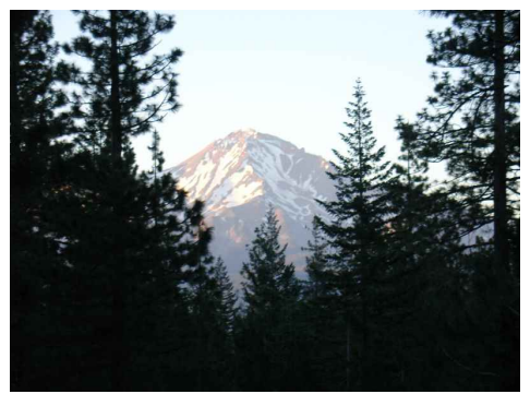
Mount Shasta in the Summer