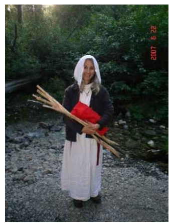
Coming back from four days in the woods