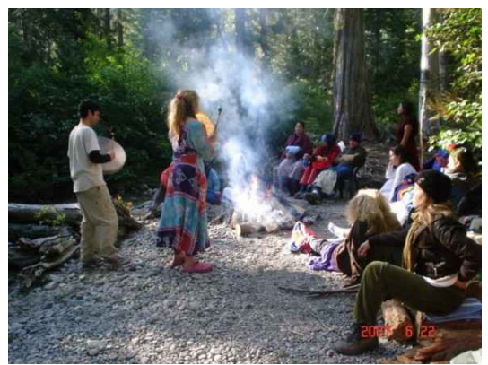
The Questors joining the Group of Supporters