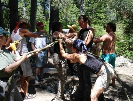
Building the Sweatlodge